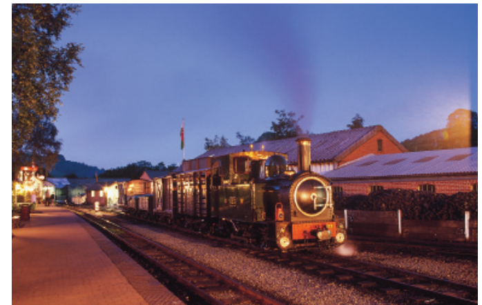
Early evening images benefit from the last remnants of colour in the night sky.