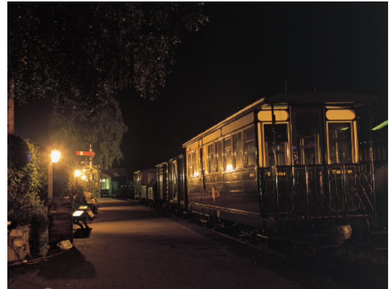
The Llanfair train at night.