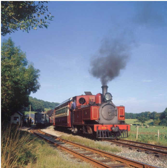
2¾ miles into the journey is the first halt at Sylfaen.