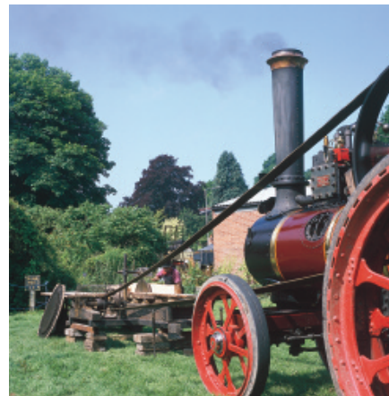
Man and machine in perfect harmony.